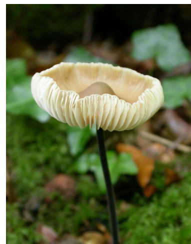
Garlic-scented Toadstool