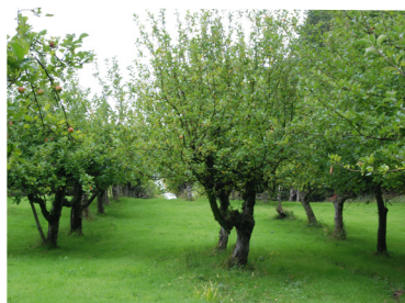
Traditional Apple Orchard

Traditional orchards represent both a productive land use and valuable wildlife habitat – in fact they are now listed as a national conservation priority under the UK's Biodiversity Action Plan (BAP). They are important for many species, including rare birds (e.g. Lesser Spotted Woodpecker), deadwood beetles notably the Noble Chafer, and fungi such as the Orchard Tooth fungus. The WWLP has been working with the People's Trust for Endangered Species (PTES) this year to carry out local surveys of our remaining old orchards. We are running an 'Apple Day' event at Fishers Farm Park (see 'Events') where we will be planting a new orchard of local apples such as Sussex Mother, Crawley Reinette and Wadhurst Pippin.